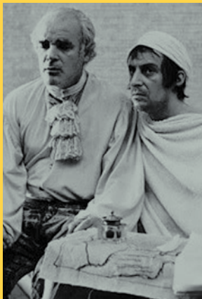
Original production of Marat/Sade, Aldwych Theatre, London 1964