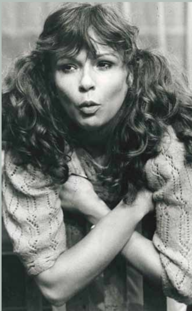
Julie Walters in Educating Rita, The Warehouse, London, 1980

Educating Rita was commissioned and premiered by the RSC in 1980. Join Willie Russell to re-live the story of how Educating Rita made it onto the stage and went on to become one of the nation's best loved stories.