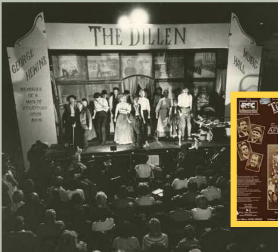
The original cast of The Dillen, Stratford upon Avon, 1983