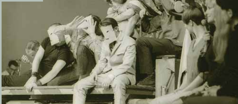
US, Aldwych Theatre, London, 1966