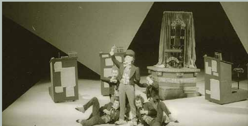
Original production of Poppy, Barbican Theatre, London, 1982

On 9 and 10 July, world famous playwright Mark Ravenhill selects his favourite plays from the RSC's back catalogue.