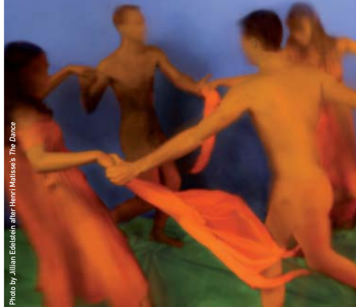
after Henri Matisse's 'The Dance'